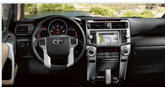
Limited 4x4 shown in Sand Beige leather with available voice-activated touch-screen DVD navigation system. [9]