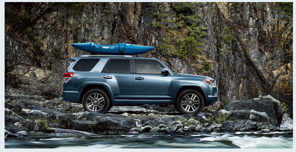
Limited 4x4 shown in Shoreline Blue Pearl [27] with available accessory roof rail cross bars.