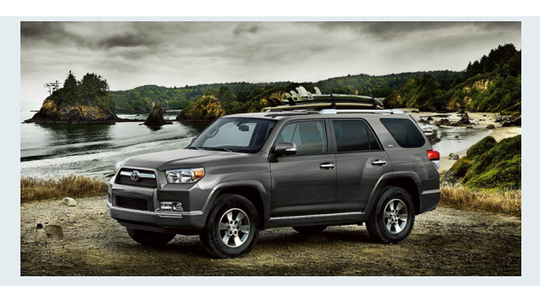
V6 SR5 4x4 shown in Magnetic Gray Metallic with available backup camera [10], Convenience Package and accessory roof rail cross bars.